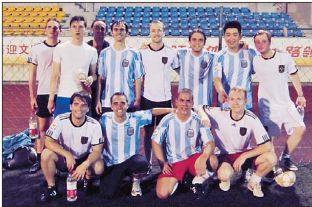
Argentina poses for a team photo ahead of their clash with Germany. The team is made up of Expo pavilion staff.