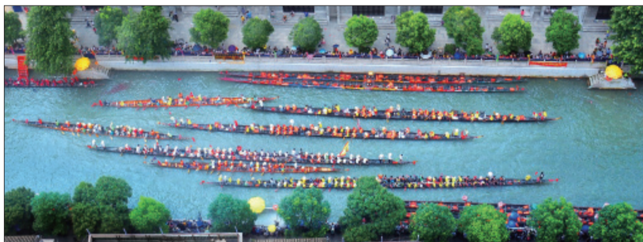
Clockwise from top: Night scene of the Central Business District of Tianhe district in Guangzhou, capital of South China's Guangdong province. Residents watch a lion dance performance at a New Year's event held in Tianhe district. Residents compete in dragon boat racing to celebrate a traditional festival in Tianhe district. Performers play music on the roof of a high building in Tianhe district.

technology industries, Tianhe has 215 registered financial agencies and 33 enterprises listed on the stock market. It boasts 378 research and development institutes set up by enterprises, 86 institutes affiliated to universities and governments, and 239 engineering technology research centers.