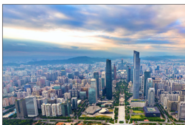
Scenery of Zhujiang New Town in Tianhe district of Guangzhou, capital of Guangdong province.

A total of 140 Fortune Global 500 companies have established 184 offices in the CBD of