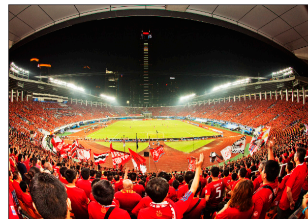
Residents watch a soccer game held at Tianhe Stadium in Tianhe district of Guangzhou.

"Zurich is experienced in cyber attack insurance. We are convinced that there will be plenty of opportunities for business with the information technology industry."