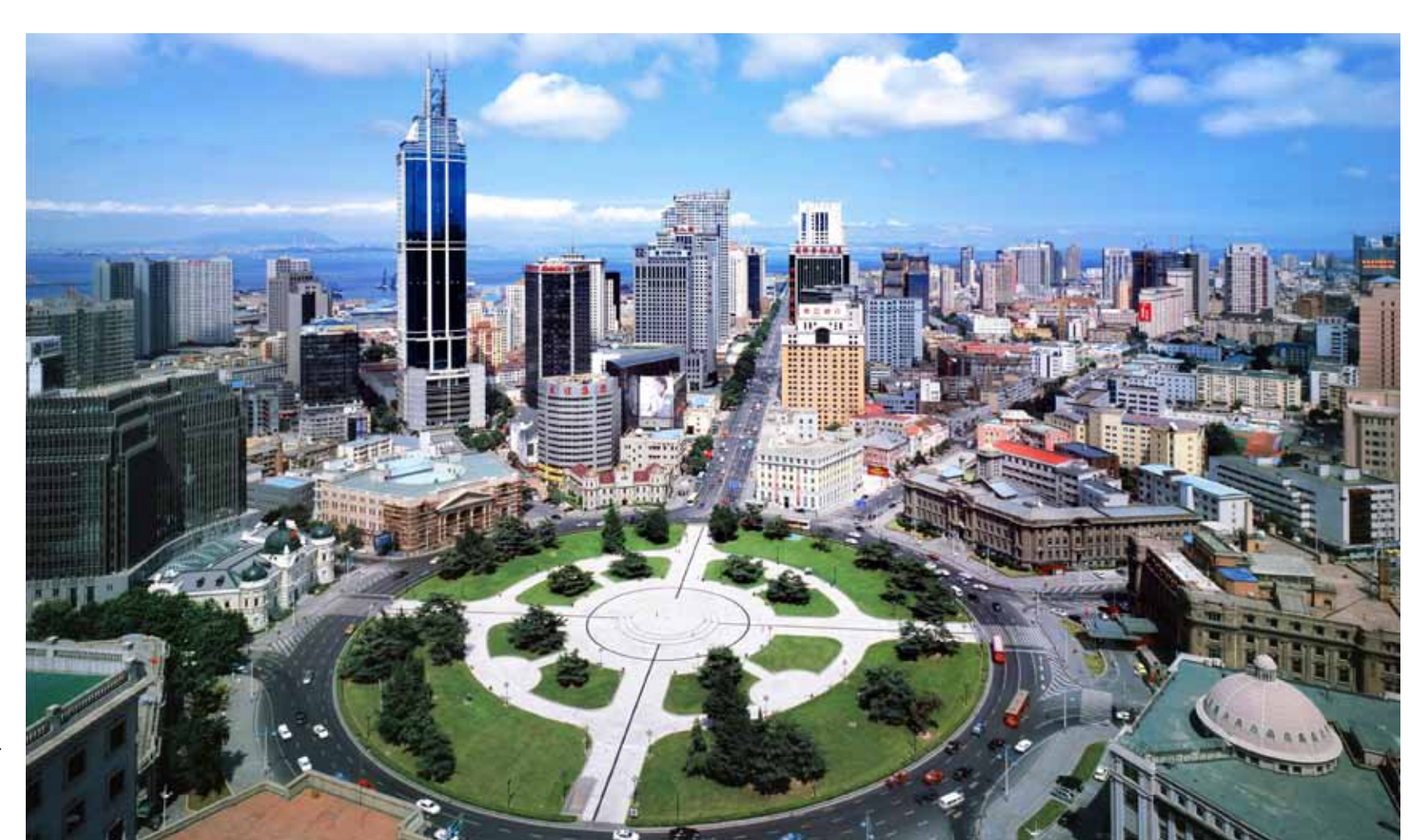
The area surrounding the Zhongshan Square is the central business district of the city.

effort, so Dalian is set to lead the economic growth of the