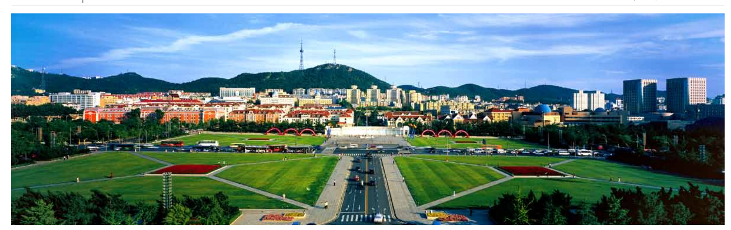
With excellent natural environment, Dalian is a pleasant place for both living and doing business.