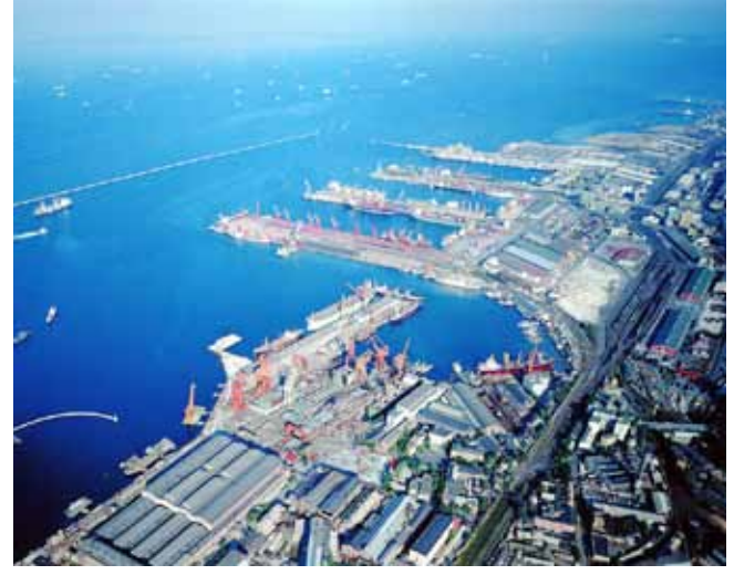
Boasting the largest port in Northeast China, Dalian is also a shipping hub in the Northeast Asia region.

In the years to come, local authorities have said they want an even greater opening up