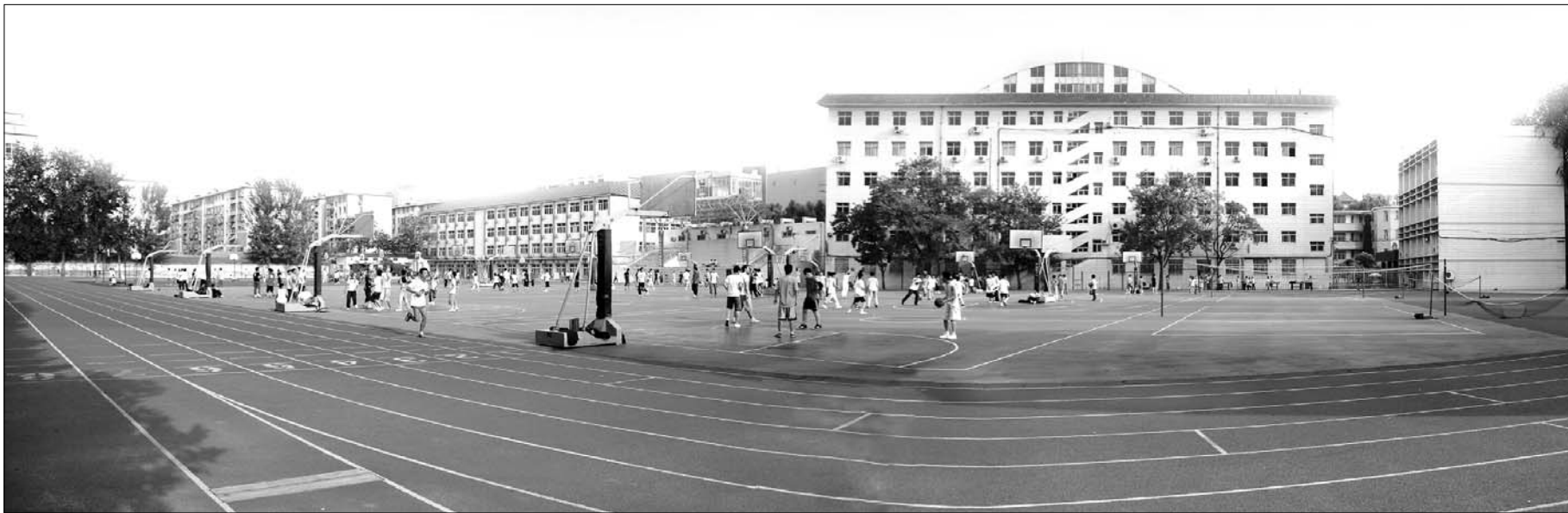
Zhengzhou Huimin Middle School focuses on formation of a healthy personality and all-round development of students, said its principal.