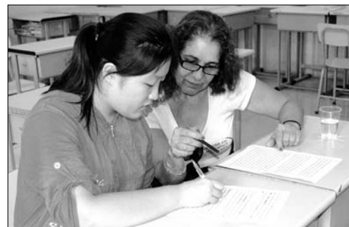
Tutoring a student at Zhengzhou Foreign Language School.

independent. "To be independent is widely advocated in Western countries. It is beneficial to our students," he said.