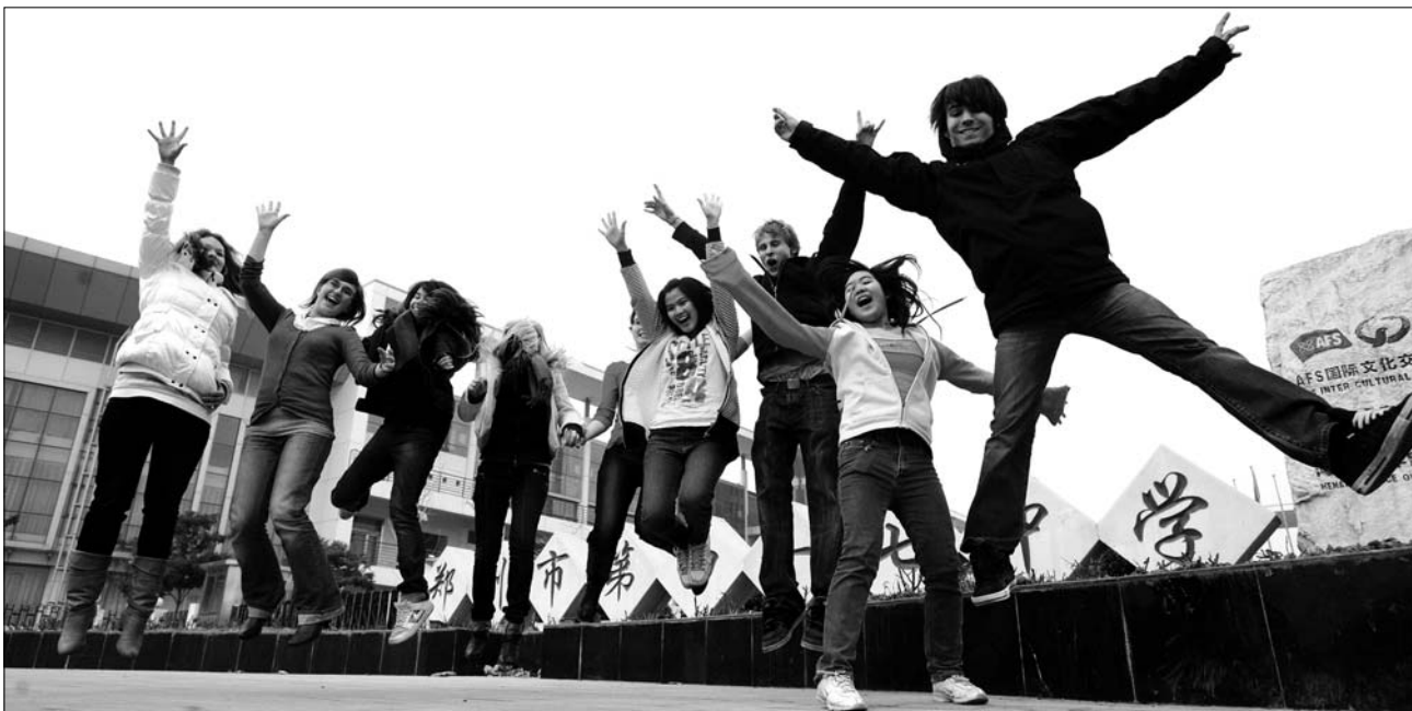
Zhengzhou No 47 Middle School has a number of foreign students who add to its growing international atmosphere.