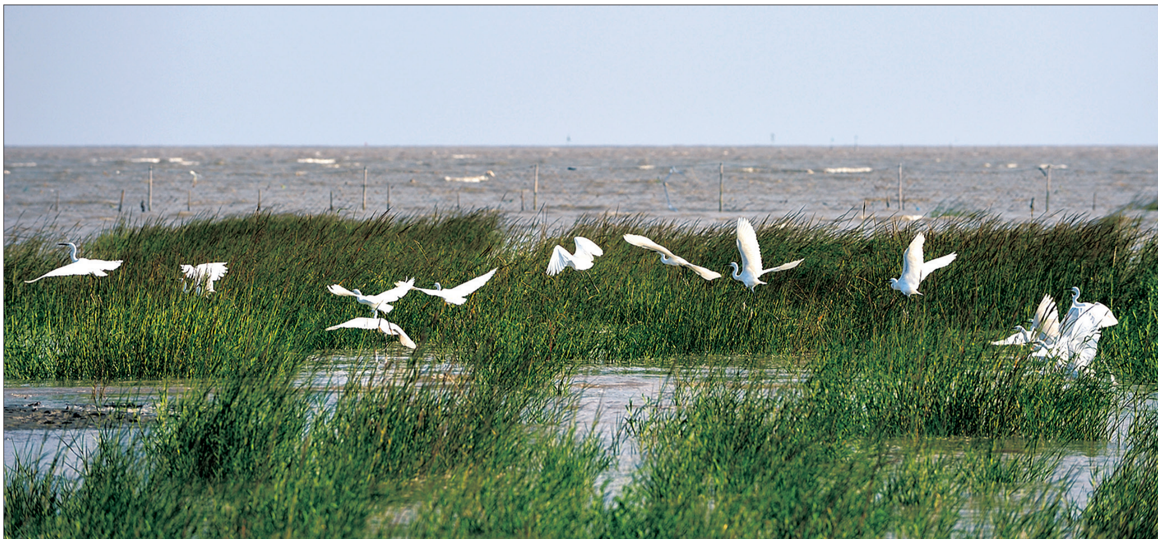
Qidong's ecological wetlands on the coast of the Yellow Sea.