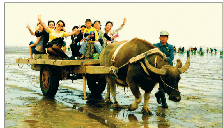
Tourists travel by oxcart at Qidong's scenic Gold Beach.