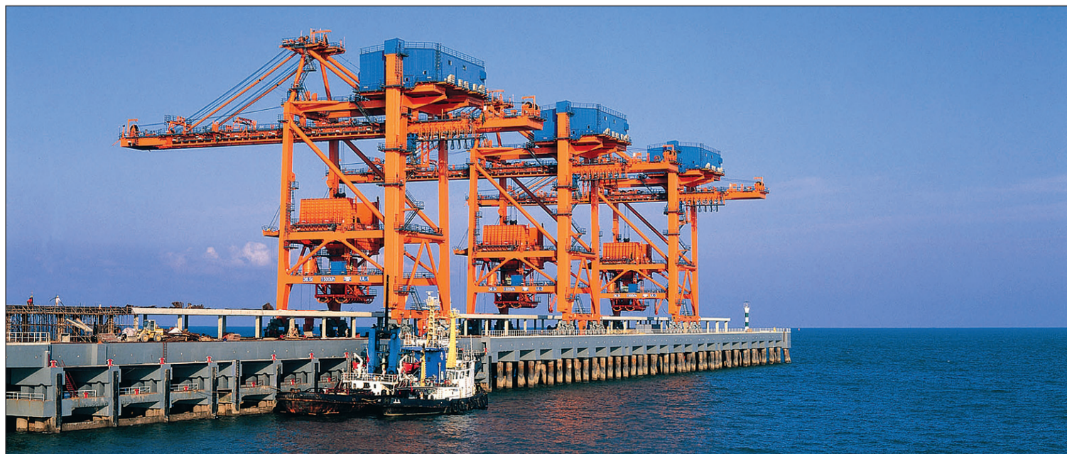
Photo shows a berth at Qidong's Lusigang Port. Only 78 km from the Pudong district of Shanghai, it is the most important harbor in the north side of Shanghai.

In addition, the city boasts an excellent tradition of woodcutting and other handicrafts. The Qidong Art Academy is reputed to be China's top woodcutting academy.