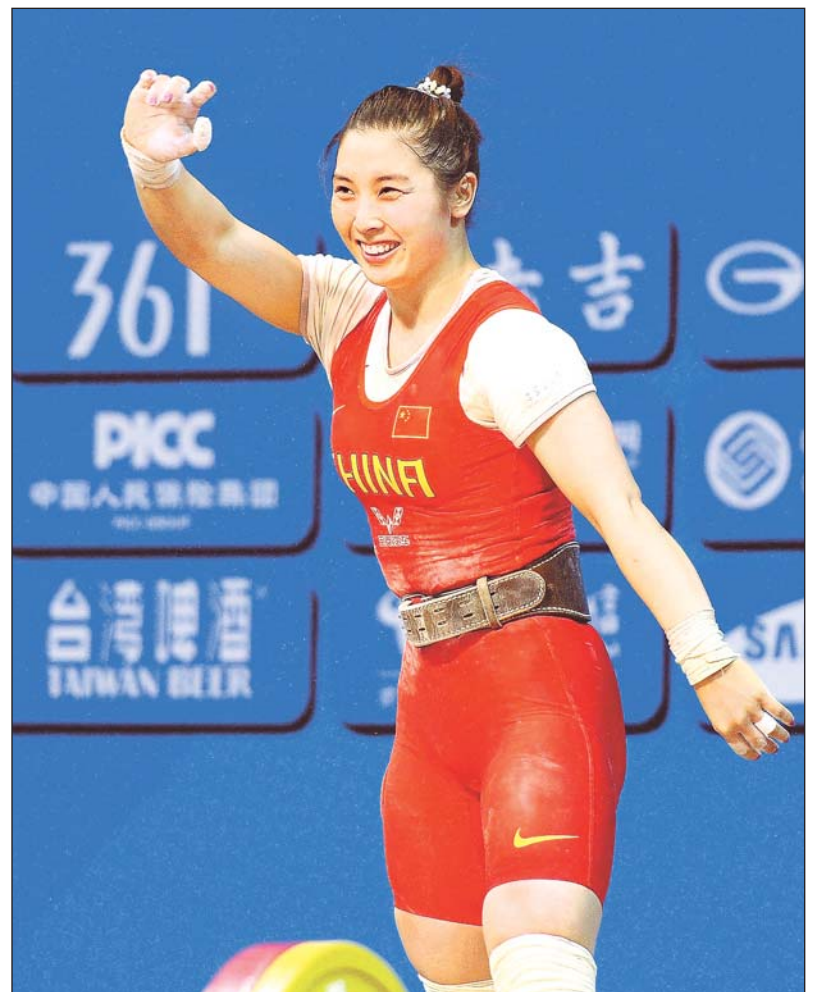
YANG SHIZHONG / CHINA DAILY