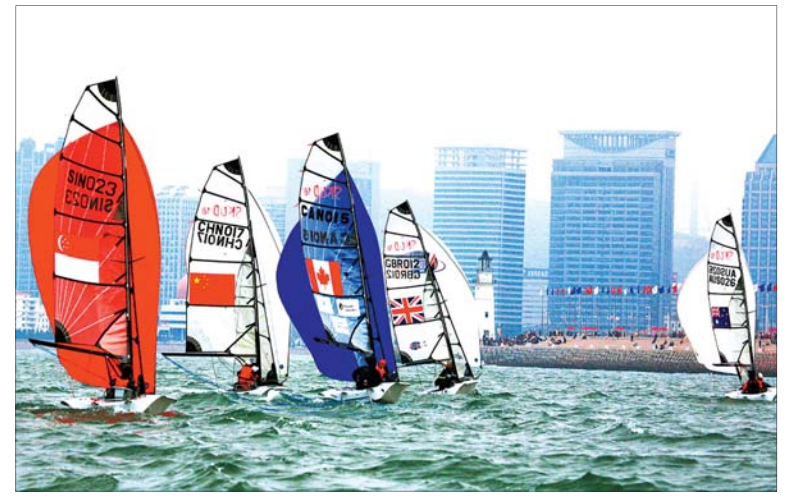
SKUD 18, a new event that will be added for the 2008 Paralympic Sailing Competition, during the 2008 International Association for Disabled Sailing (IFDS) Qingdao International Regatta. The city's sailing facilities have impressed both athletes and IFDS officials.

Previous Paralympic sailing competitions only saw two sports - one-person and three person keelboats. A new event boat known as SKUD 18 will be added for the 2008 Paralympic Sailing Competition