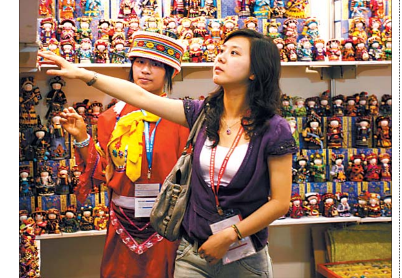
Arts and crafts from Guizhou province are popular among visitors.

For the convenience of customers, there are also areas set aside for international purchasing negotiation as well as pavilions housing electronic commerce, international logistics and famous international