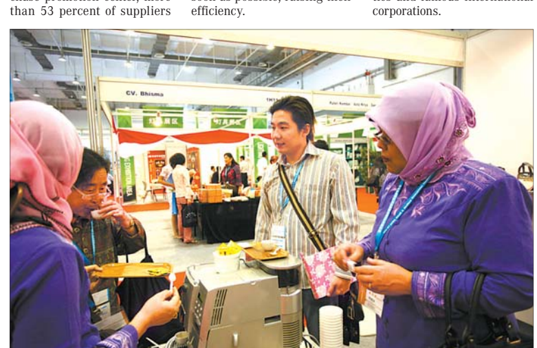
Tasting Indonesian coffee