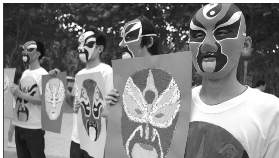
A Peking Opera mask show on the street in Liaocheng, Shandong province. A court ruled that the design company's logo violated the rights of the original artist, who added his own original style to the traditional art form.