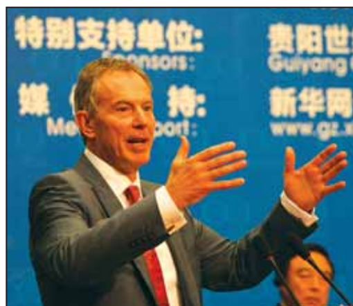
Former UK Prime Minister Tony Blair addressed the Eco-Forum Global on Aug 22, 2009.