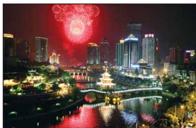
Jiaxiu Pavilion, perched on a boulder in the Nanming River in the south of Guiyang, was built in 1598.

Contact the writers at yangjun@chinadaily.com.cn, sujiangyuan@chinadaily.com.cn and zhaokai@chinadaily.com.cn