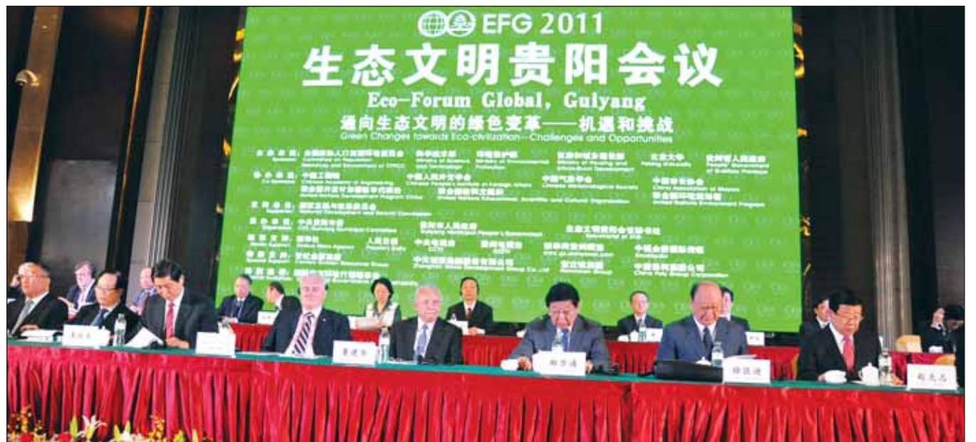
The 2011 Eco-Forum Global drew a number of senior government officials and scientists, and this year the number is expected to reach another high.

In addition, the city's forest coverage rate has increased to