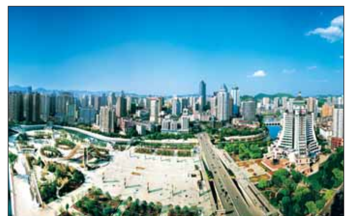
Zhucheng Square, built on the bank of the Nanming River, is a landmark of Guiyang.