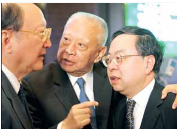
Tung Chee Hwa (center), the first elected chief executive of Hong Kong special administrative region, took part in the event last year.

Contact the writers at yangjun@chinadaily.com.cn and zhaokai@chinadaily.com.cn