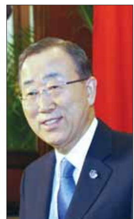
On the opening ceremony of 2011 EFG, UN Secretary-General Ban Ki-moon sent a congratulatory letter to the event.