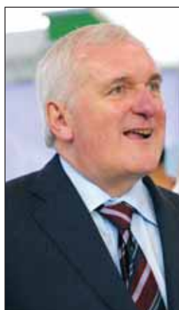
Former Premier of Ireland Bertie Aher joined the event in 2011.