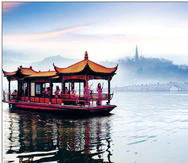
The city has been known as "the earthly paradise".

When night falls, the West Lake sits quietly and calmly among shimmering lights. After dinner at North Mountain Road, one can have a wonderful experience strolling leisurely on the Bai Causeway and the Su Causeway.