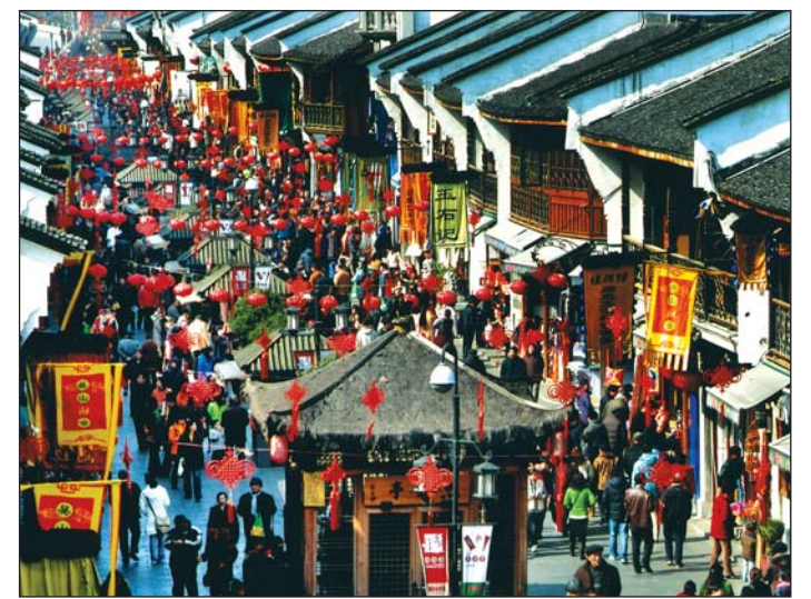
With a long history, the Wushan temple fair is one of the most crowded fairs in Hangzhou.