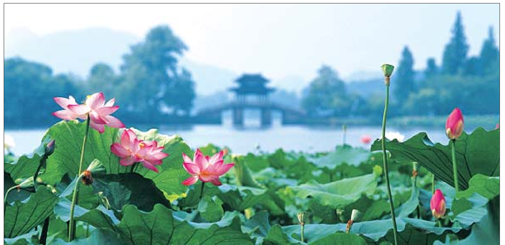
The city is famed for its lotus blossoms, which bloom in summer.