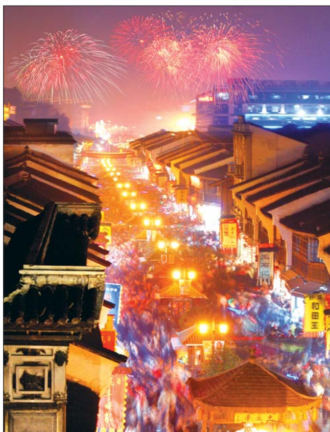
The new look of an ancient street in Hangzhou.