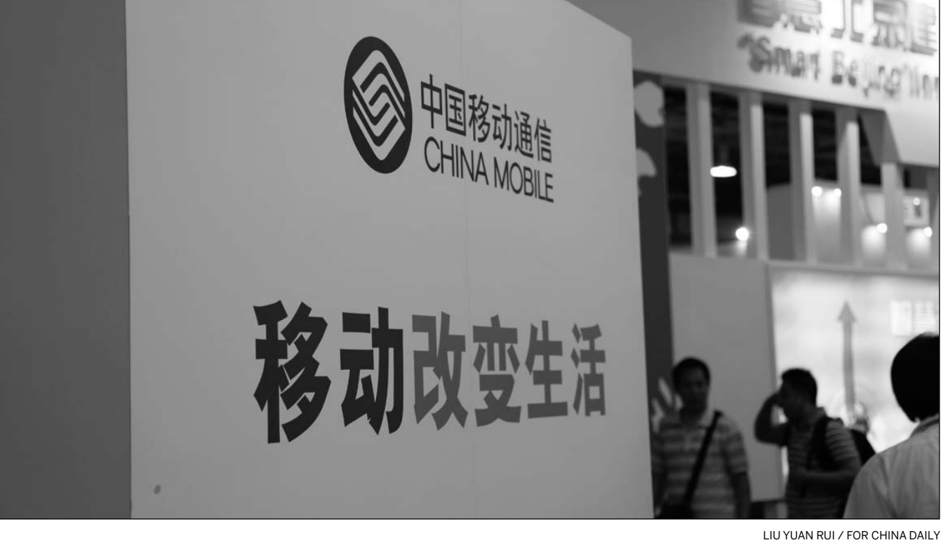
China Mobile, together with other telecom operators in the country, have seen their business growth maintaining a strong upward momentum thanks to an increasing number of subscribers using smartphones and the rapid development of 3G technology in the country.

lag (behind) economic trends. People firstly experience deteriorating personal finances before they start cutting back on telecoms spend(ing). Therefore, as long as the economic headaches persist in southern Europe (and with concerns mounting in the UK, too), the road ahead will be uncertain for Vodafone and other Europe-centric telecom operators," Obiodu wrote in a research note.