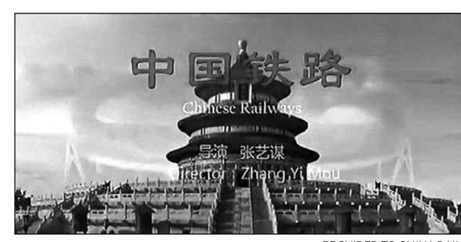
A screen shot of Chinese Railways , a promotional video made by the Ministry of Railways.