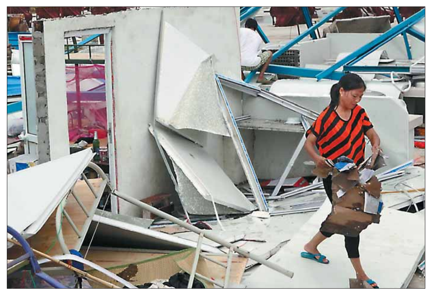
A woman picks up her belongings from the debris of a makeshift house destroyed in a typhoon in Ganyu, Jiangsu province, on Friday. Typhoon Damrey made landfall in the province late on Thursday night, bringing heavy rains and gales, and causing damages.

He urged local authorities to ensure safety and conduct evacuations in a timely manner,