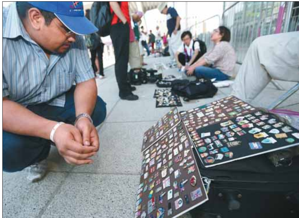
Pin collectors trade their favorites outside the Olympic Village in London, including the official 2012 mascots Wenlock and Mandeville, produced by Chinese manufacturers.

Before the Games, the leader of the US senate, Harry Reid, called for TeamUSA's uni-