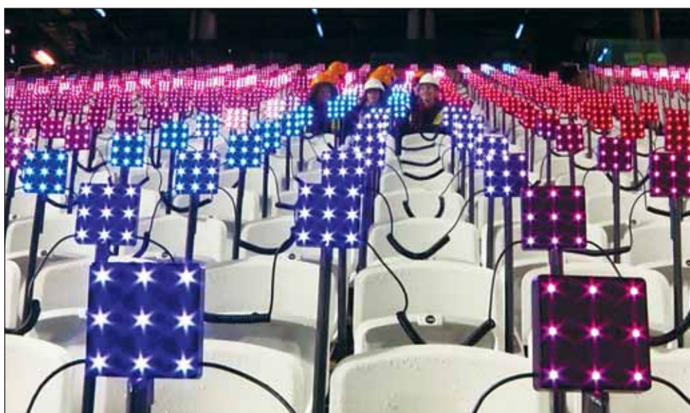
LEDs at London 2012 by Crystal CG International, which rose to fame during the 2008 Beijing Games. The company also provided animations for the opening ceremony in London.

forms to be piled in a heap and burned. Reid was outraged that the outfits were designed by the US couturier Ralph Lauren, but made in China.