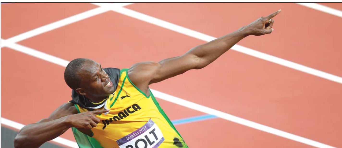
Jamaica's Usain Bolt poses after his win in the men's 200 meters final at the Olympics. Bolt staked a claim to the title of greatest sprinter ever when he added the 200 to the gold medal he'd won in the 100 earlier in the week and the three golds he won in Beijing. "I'm a legend now," he said.