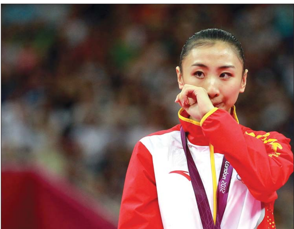
Defending Olympic women's trampoline champion He Wenna of China cries on the podium after finishing a disappointing third at the London Games.