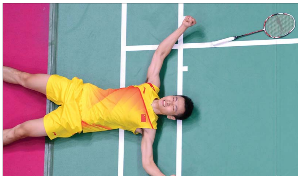
China's Zhang Nan falls to the court after victory in the mixed doubles badminton final with Zhao Yunlei against teammates Ma Jin and Xu Chen. It was the first time China won both the gold and silver medals.