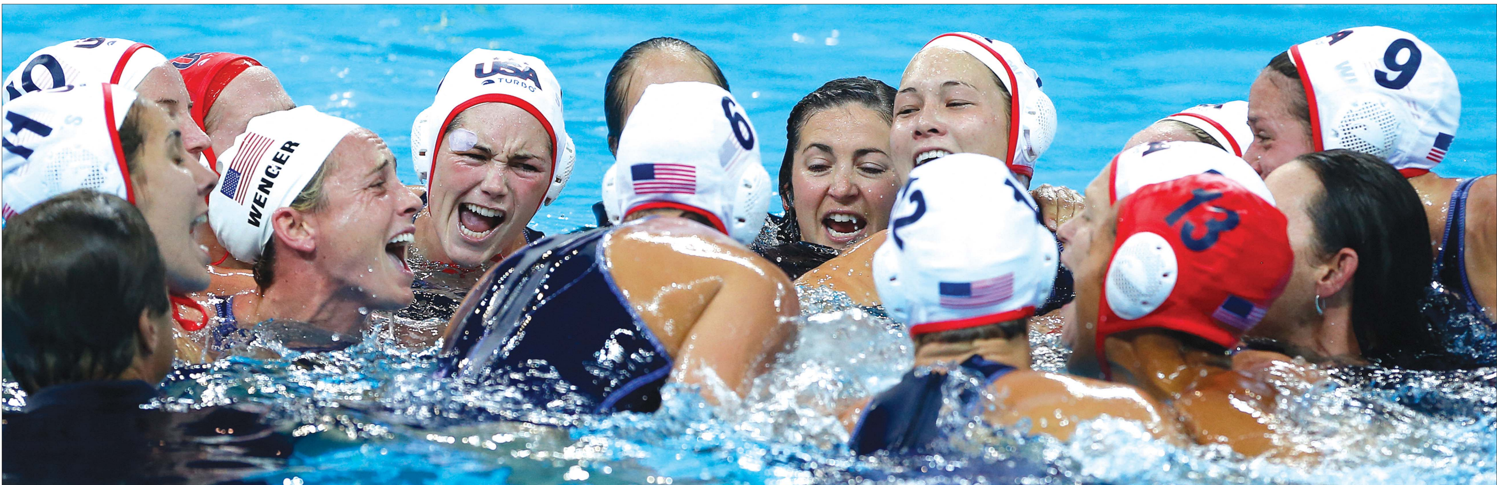
Members of the United States women's water polo team celebrate after winning the gold medal match against Spain on Thursday. "It's been a long four years since Beijing," goalie Betsy Armstrong said. "It's been up and down, personnel changes, a coaching change, everything you can think of. This is perfect." The team was rocked by a disappointing silver medal at the 2008 Games. "I can't describe it. It's the end of a journey, and I got my fairy-tale ending," US captain Brenda Villa said.