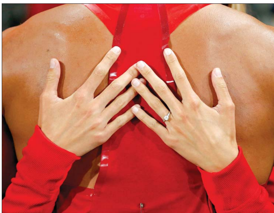
Ashton Eaton of the US is embraced by his fiancée Brianne Theisen following the 1500m race portion of the decathlon at the London Olympics. Eaton claimed the gold medal.