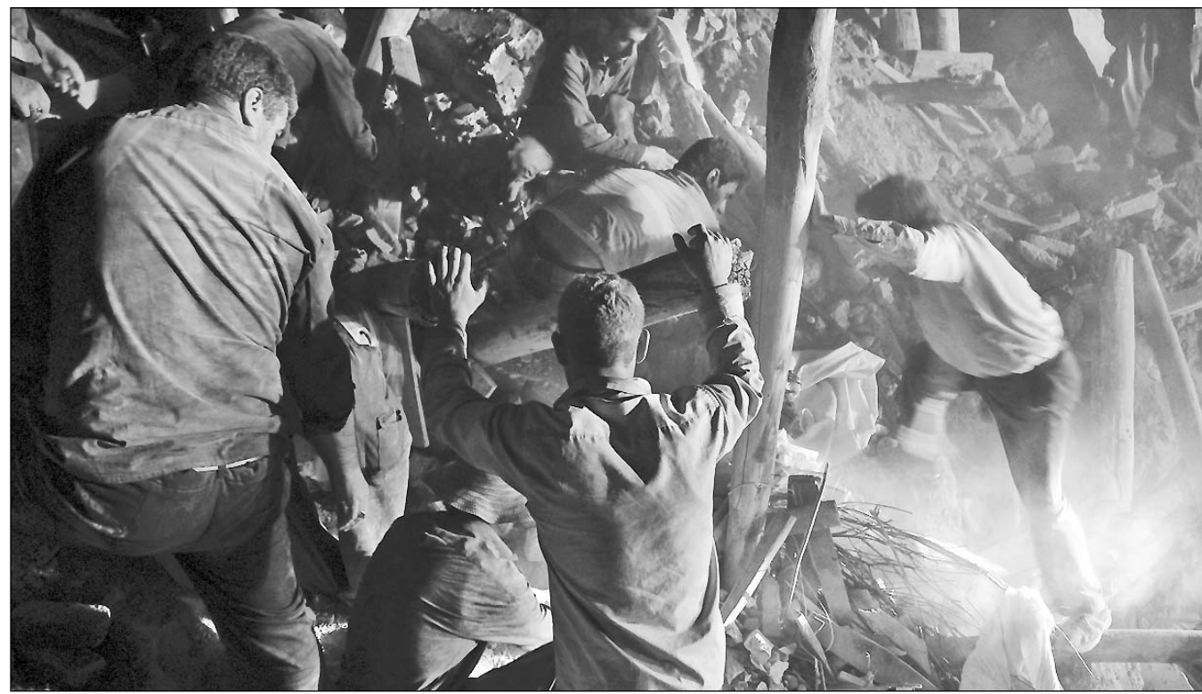
Iranian residents and rescue workers search for survivors in the rubble of a house in a village, near the town of Varzaqan, Iran, after two devastating earthquakes hit that area on Saturday. The two devastating earthquakes in northwest Iran killed some 300 people and injured thousands. Rescue teams made massive efforts to dig survivors out of the rubble.