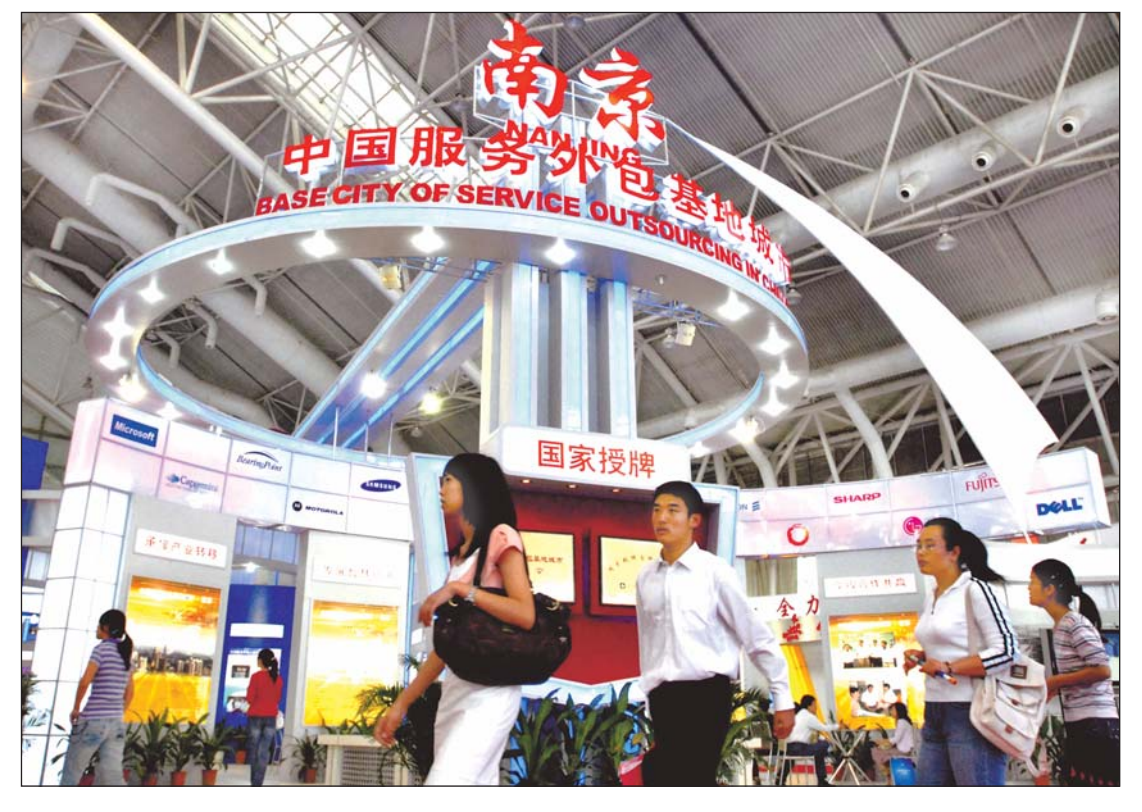
Nanjing is among the nation's leading cities for service outsourcing.

Today 486 companies with a total staff of more than 115,000