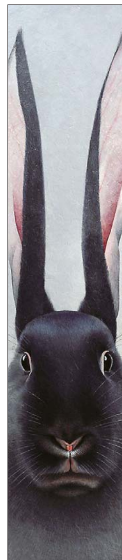
OCTOBER 21 Contrast Gallery

An Incurable Classicist showcases 21 oil paintings by artist Shao Fan. Shao's paintings are modern interpretations of traditional "Literati" thought and aesthetics. They explore the ramifications of philosophical and cultural changes taking place in China today. His first major solo exhibition takes this exploration to new heights, crossing the chasm where traditional and contemporary concepts converge, and the individual becomes one with nature.