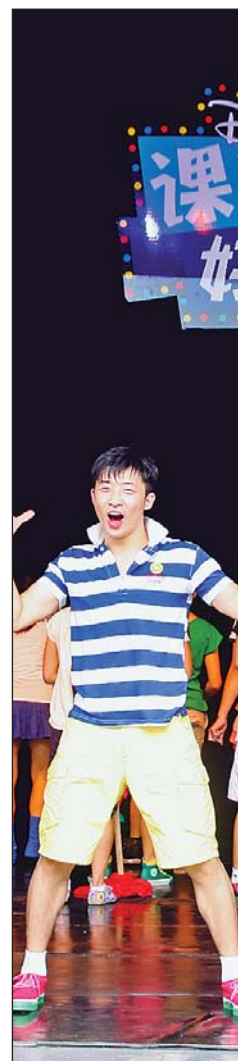
OCTOBER 20 Dock Theater, Zone D, Expo Site

Disney has created a live show called As the Bell Rings based on its popular TV series of the same name. The show in Chinese combines song and dance with acrobatics and will be staged at the Dock Theater in Zone D of the Expo Site this month. Shanghai City Animation Media Co Ltd joined hands with an acrobatics school and the Shanghai Theatre Academy to create this stage show. All of the actors, aged 16 to 20, are professional acrobats from the Wujiao Acrobatic Art School in Hebei province.