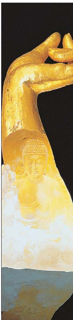
OCTOBER 18 Liuli China Museum

Liuli China Museum has re-opened on Taikang Road after moving out of the Xintiandi community two years ago. The museum, the only one in the city dedicated to glass art, was founded by former movie actress-turned glass sculptor Loretta Hui-shan Yang. A giant peony made of stainless steel covers one of the building's exterior walls; while a café and souvenir shop take up the ground floor. The second and third floors are reserved for the museum's exhibitions, which include ancient glass works from over 1,500 years ago.