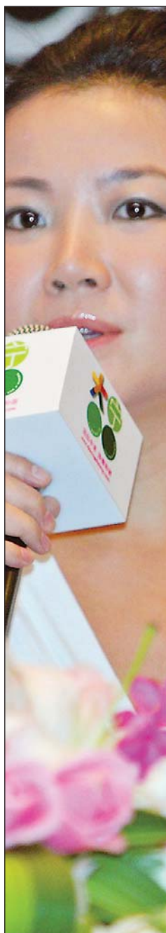
OCTOBER 17 LifeHub@Daning

A free Chinese music festival will take place this weekend and next at the central stage of the shopping compound LifeHub. Ye Bei, a ballad singer who became well known in the mid-1990s, will perform today. Interested parties can visit www.daningedaning.com to register for front-row seats.