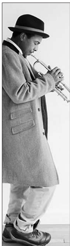
OCTOBER 15 Shanghai Center Theater

The Roy Hargrove Quintet from the United States, one of the featured jazz bands at this year's JZ festival, will perform in Shanghai on this date. Few if any contemporary musicians have kept alive the spirit of the after-hours jam session as vigorously as Hargrove, an aggressive trumpeter with a charming, relaxed stage manner. He was born in Texas and is now a feature of the New York scene. Hargrove made his major label debut at the age of 21 for Novus. He made several more albums for the label before moving on to Verve. Hargrove also leads a big band packed with the cream of New York's younger talent.