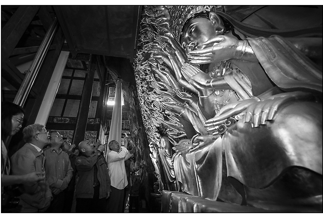
A team of heritage preservation experts inspect repair work on the Thousand-Hand Goddess of Mercy statue in Chongqing on Wednesday. Public viewing will resume on June 13.

"They are remarkable for their aesthetic quality, their rich diversity of subject matter, secular and religious, and the light that they shed on everyday life during this period. They provide outstanding evidence of the harmonious synthesis of Buddhism, Taoism and Confu-