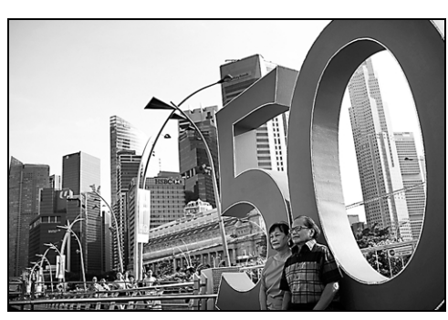
The number "50" is displayed in Singapore's financial district on Saturday to celebrate the city-state's half-century of independence from Malaysia.