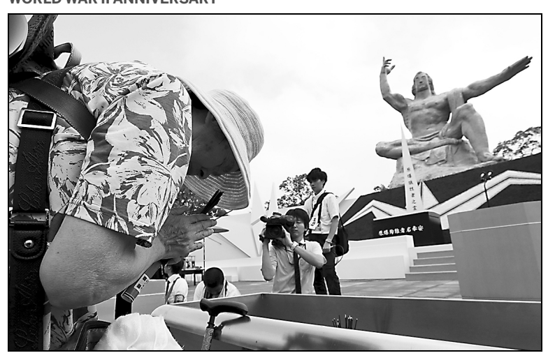
A woman prays for victims of the 1945 atomic bombing in front of the Peace Statue before a ceremony commemorating the 70th anniversary of the bombing, at Nagasaki's Peace Park in Nagasaki, western