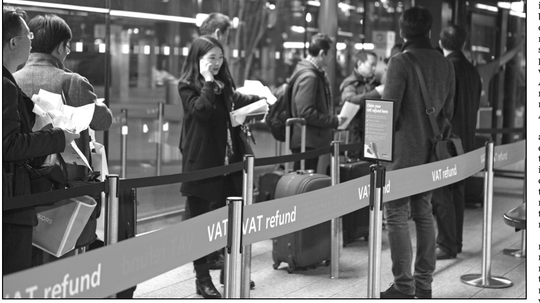
Chinese tourists stand in a queue to get VAT refund at London Heathrow Airport Terminal 3.

The complexities of the procedure, the number of companies that operate refund programs, and long lines at