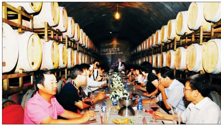
A tasting was held in the underground cellar at Changyu on Aug 21 to promote its new wine investment product.

After a year and a half investors can sell the financial instrument at a promised annual return of 7 percent — twice the current benchmark one-year bank deposit rate of 3.5 percent — or take possession of the wine itself.