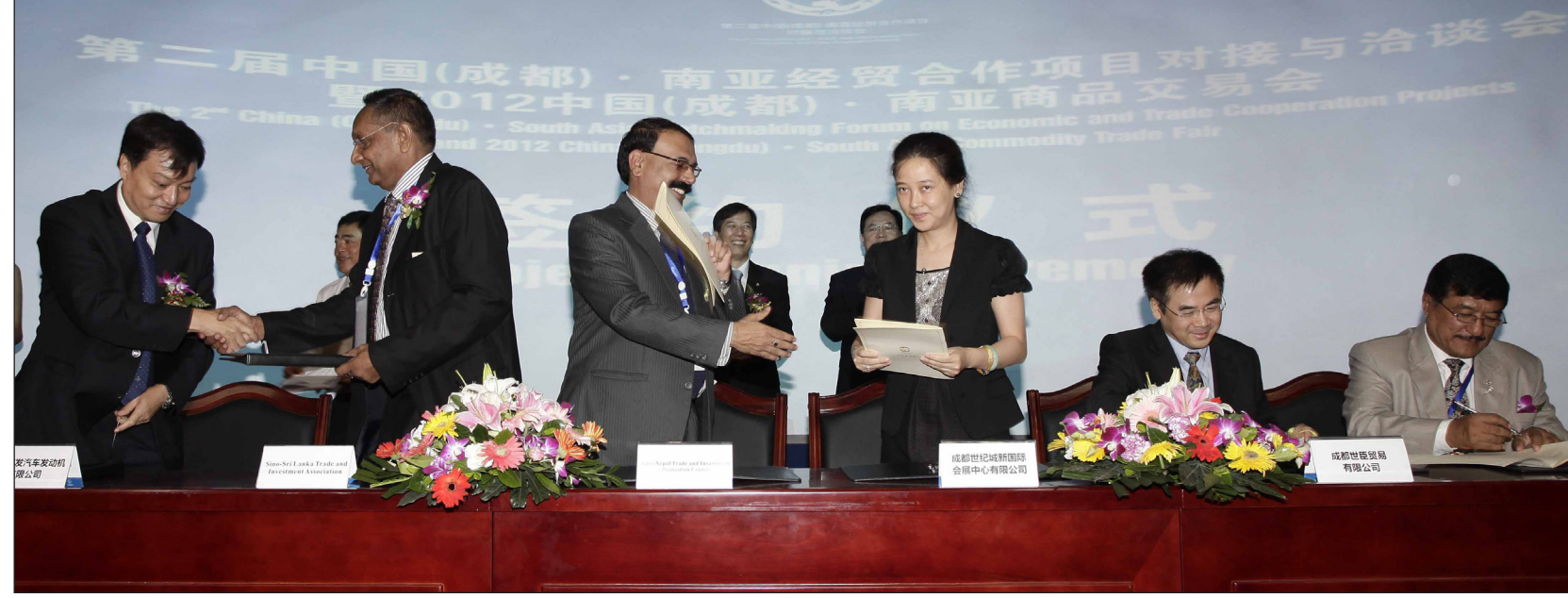
Trade representatives from South and Southeast Asian countries have business talks and sign cooperation contracts with their Chinese counterparts at the second China-South Asia Economic Trade Cooperation Fair in Chengdu.

exports to South Asian countries reach $1.1 billion, an increase of 10 percent. Local companies from