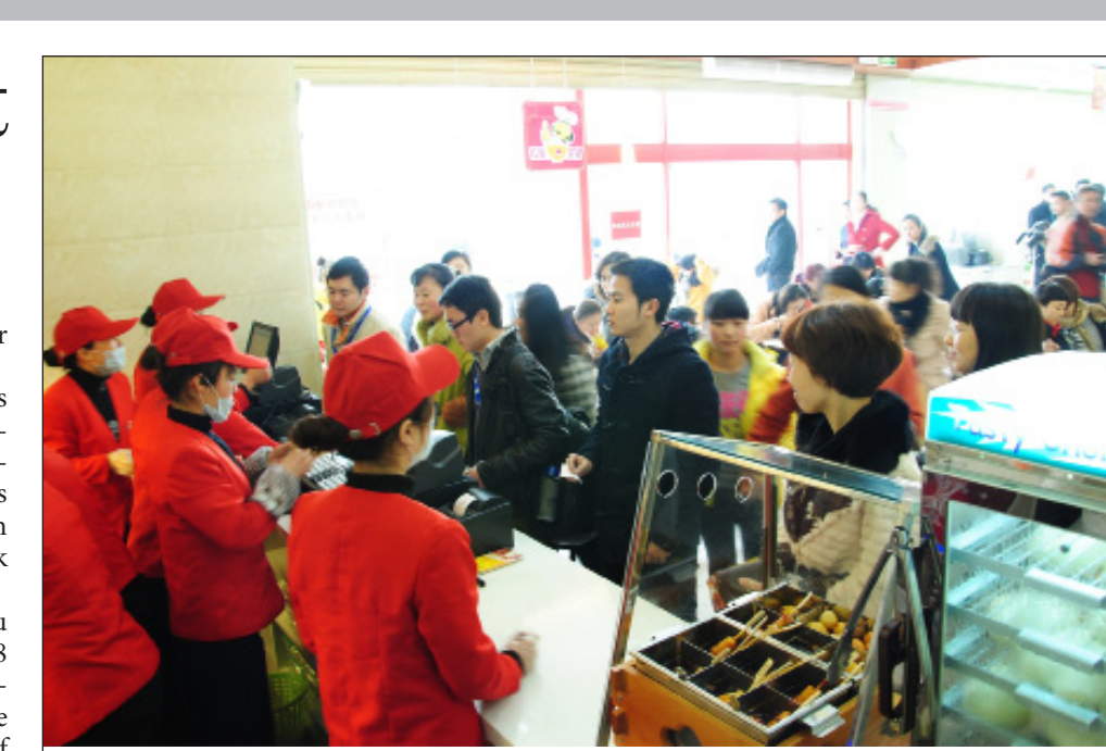
Customers shop at a Hongqi convenience store in Chengdu. Chengdu Hongqi Chain Co Ltd, supported by the Chengdu Federation of Industry and Commerce, is a leading chain retailer.

Contact the writers through zhongnan@chinadaily.com.cn.