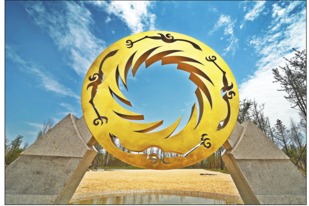
Sunbird logo derived from a 3,000-year-old disc made by the Jinsha civilization found in the city's western suburbs. It has been hailed as one of the major archeological discoveries in China.

51 countries and regions' residents are eligible for a 72-hour visa