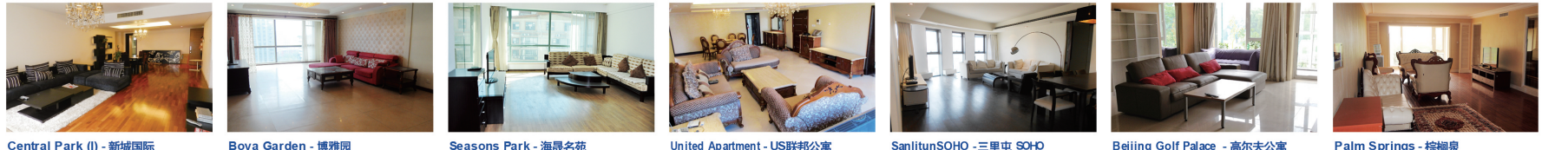
Central Park (I) - 新城国际 ¥43,000 Boya Garden - 博雅园 ¥20,000 Seasons Park - 海晟名苑 ¥30,000 United Apartment - US联邦公寓 ¥23,000 SanlitunSOHO - 三里屯 SOHO ¥30,000 Beijing Golf Palace - 高尔夫公寓 ¥34,000 Palm Springs - 棕榈泉 ¥25,000