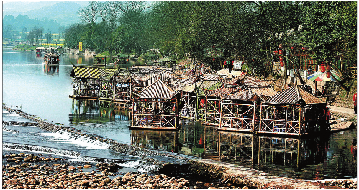
Pingle ancient town is a popular rural attraction in Chengdu.