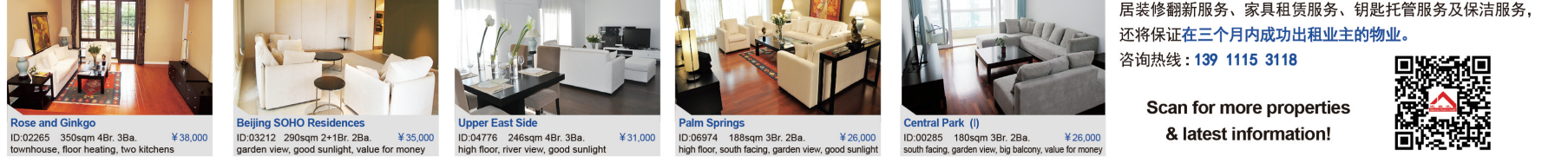
Rose and Ginkgo ID:02265 350sqm 4Br. 3Ba. ¥38,000 Beijing SOHO Residences ID:03212 290sqm 2+1Br. 2Ba. ¥35,000 Upper East Side ID:04776 246sqm 4Br. 3Ba. ¥31,000 Palm Springs ID:06974 188sqm 3Br. 2Ba. ¥26,000 Central Park (I) ID:00285 180sqm 3Br. 2Ba. ¥26,000

JRE面向业主特推“物业委托服务”。我们不但为业主提供家居装修翻新服务、家具租赁服务、钥匙托管服务及保洁服务，还将保证在三个月内成功出租业主的物业。 咨询热线：139 1115 3118