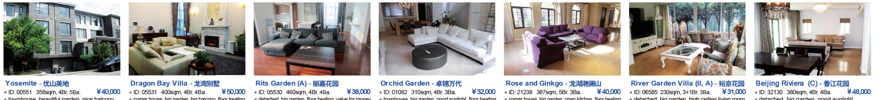
Yosemite - 忧山美地 ¥40,000 Dragon Bay Villa - 龙湾别墅 ¥50,000 Rits Garden (A) - 丽苑花园 ¥38,000 Orchid Garden - 卓锦万代 ¥32,000 Rose and Ginkgo - 龙湖锦澜山 ¥40,000 River Garden Villa (II, A) - 裕京花园 ¥31,000 Beijing Riviera (C) - 香江花园 ¥48,000