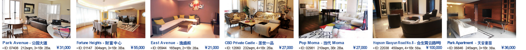
Park Avenue - 公园大道 ¥31,000 Fortune Heights - 财富中心 ¥55,000 East Avenue - 逸盛阁 ¥21,000 CBD Private Castle - 圣世一品 ¥27,000 Pop Moma - 当代 Moma ¥27,000 Hopson Xiaoyun Road No.8 - 合生霄云路8号 ¥100,000 Park Apartment - 天安豪园 ¥36,000