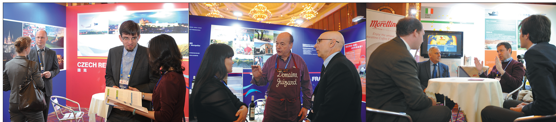
Overseas guests from more than 30 countries, representing governments, companies, organizations, industry parks and universities, attend seminars and forums at the fair to discuss innovation and entrepreneurship.