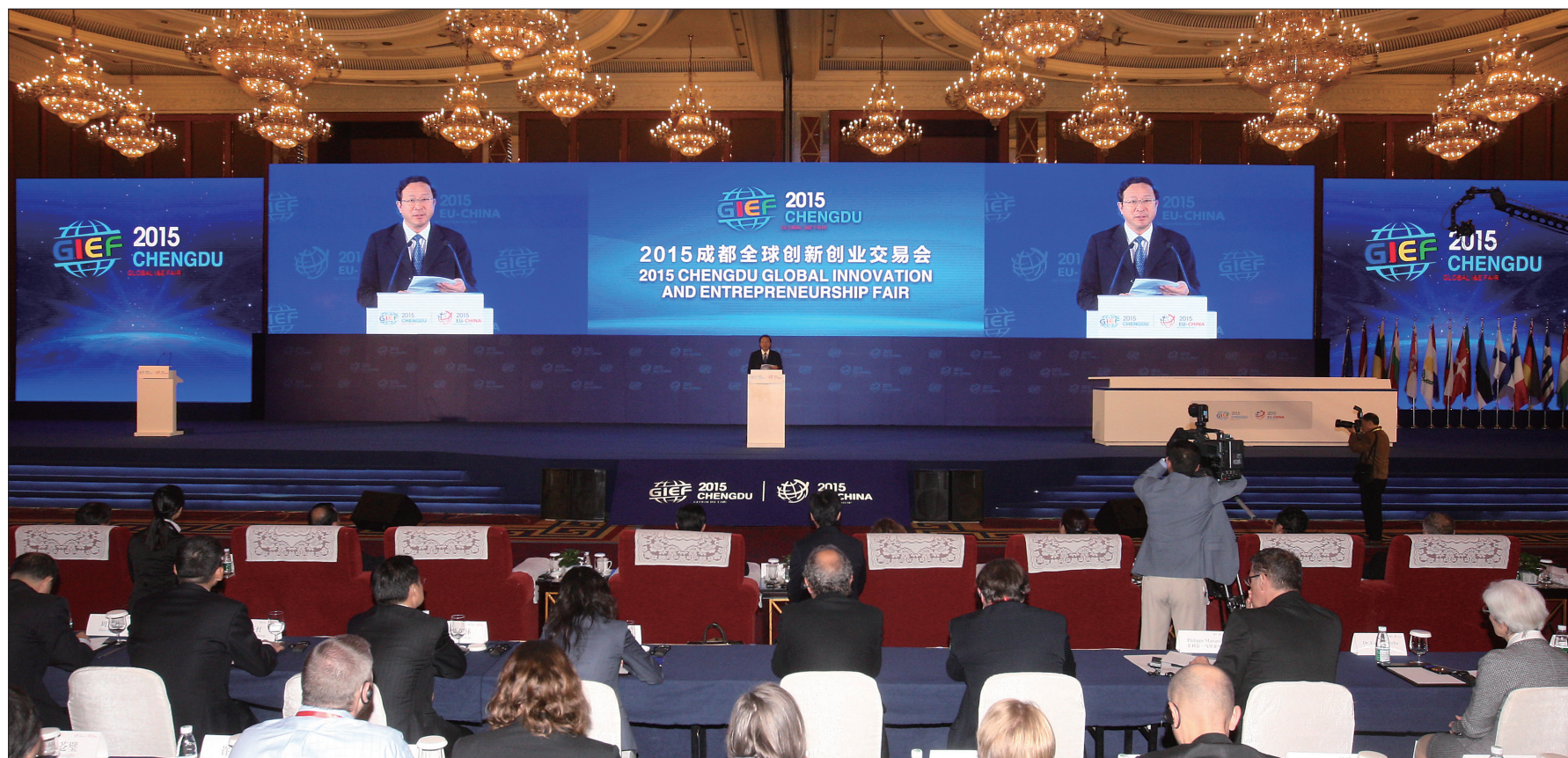
Representatives from the world's popular entrepreneurial cities, industry leaders, universities and top industry zones and business incubators attend the Chengdu Global Innovation and Entrepreneurship Fair.