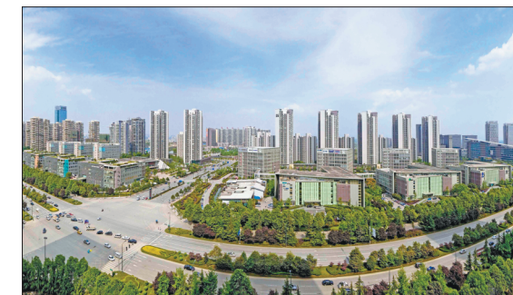
Chengdu has launched a range of public innovation projects, with State-level new areas — the Chengdu High-tech Industrial Development Zone and the Tianfu New Area — as its economic powerhouses.

Funding help To ease funding pressure faced by many startups, the government has also encouraged financial institu-