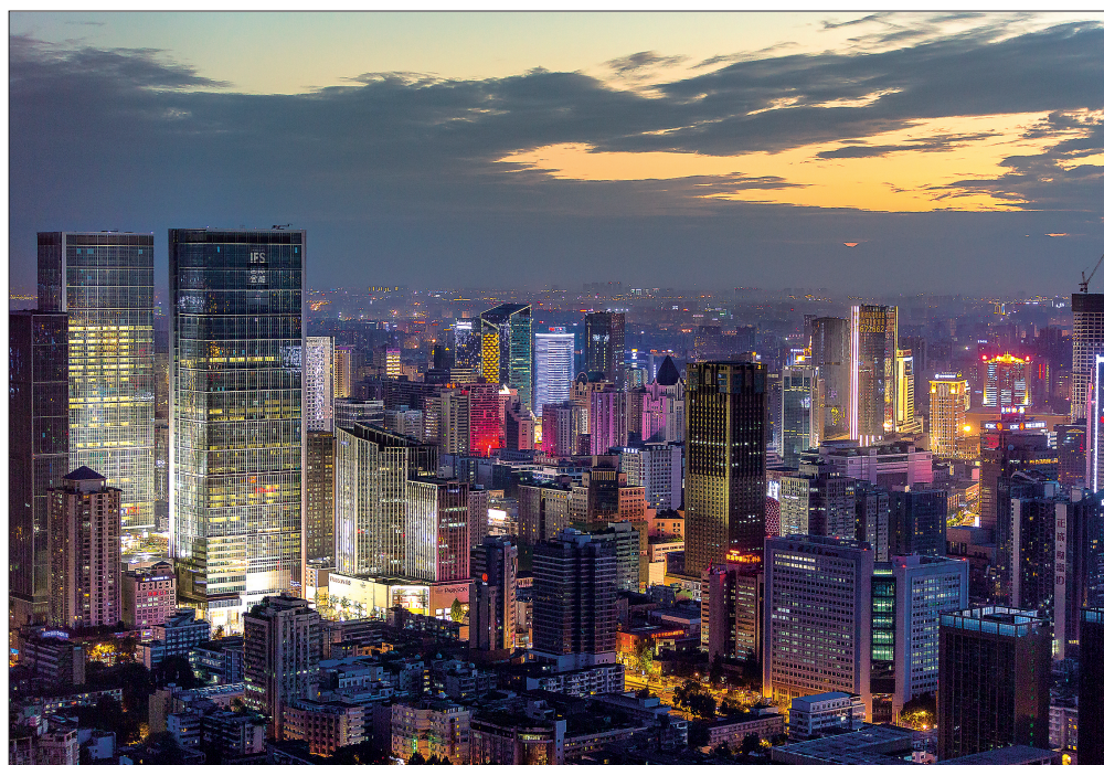
A night view of Chengdu. The city has become one of the major bases for Chinese innovation and entrepreneurship.

Contact the writers through liyu@chinadaily.com.cn