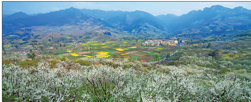
LEFT: SPECTACULAR VIEWS of the Gexianshan Mountain in Pengzhou, where Longmenshan National Geological Park is located. RIGHT: A PANDA AT THE BAISHUIHE RESERVE, a key part of the Giant Panda National Park.