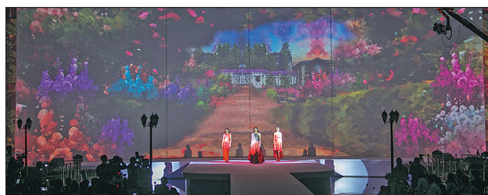
LEFT: CHENGDU FASHION WEEK was held in Pengzhou last year. The city is one of the 21 cities under the administration of Chengdu, capital of Sichuan province. RIGHT: PENGZHOU is known for its peonies, The blossom is favored by local residents.