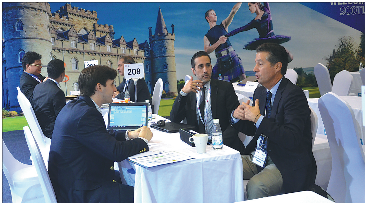
BUSINESS REPS talk about cooperation during the 22nd World Route Development Forum.

With an investment of 71.86 billion yuan ($10.8 billion), the airport will be completed in 2019 and go into operation in 2020. The long-term target for the airport is to have six runways, with an annual capacity of 90 million passengers and 2 million metric tons of cargo.