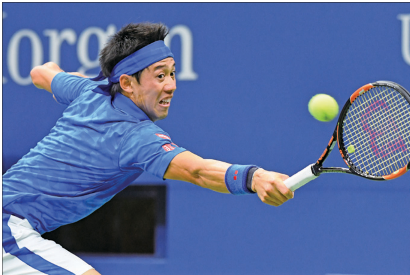
Kei Nishikori hits a return to Andy Murray in their quarterfinal match at the US Open on Wednesday.