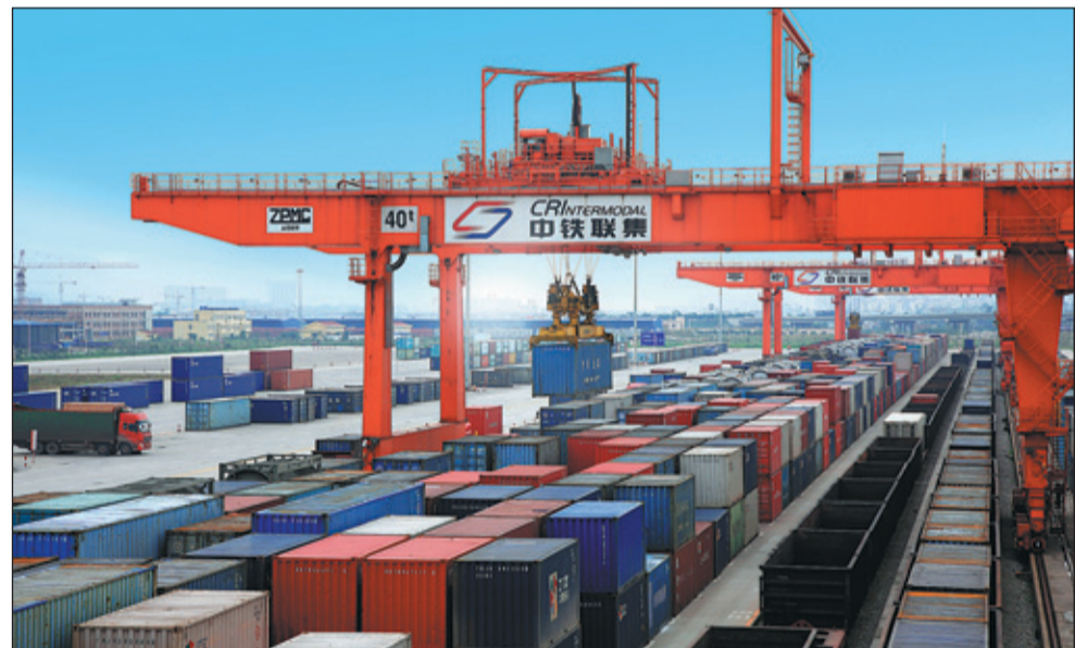
Containers are being loaded onto cargo trains destined to Europe from a railway station in Chongqing.

"The CLC has become a pioneer among the companies included in China's Road and Belt Initiative to use international capital to diversify its funding resources," Gu said.