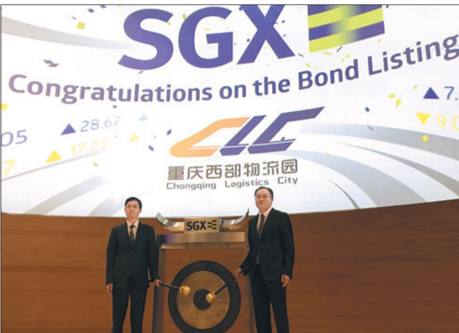
Executives of Chongqing Western Modern Logistics Industry Zone Development Construction mark the success in bond listing in Singapore on Aug 30.

Chongqing, the center of operations for the program,