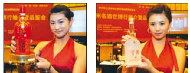
Clockwise from top: The Jinsha, Xijiu and Fanjing Mountain liquors, Guizhou's renowned liquor products apart from Moutai, were on display during the 2010 Shanghai World Expo and 2011 China (Guizhou) International Alcoholic Beverage Expo.

During last year's event, Guizhou signed 1,867 contracts on alcoholic beverages, with a trade volume of 49.74 billion yuan, including 1.5 billion yuan in imports and exports.