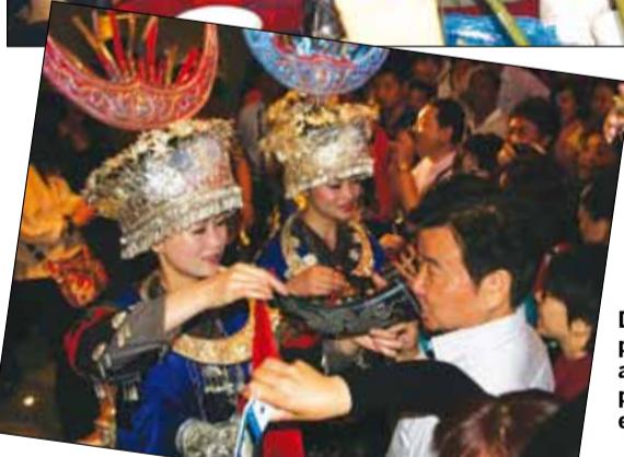
Dangmen Liquor, the wine presented to visitors upon arriving at the home of people from the Miao ethnic group.