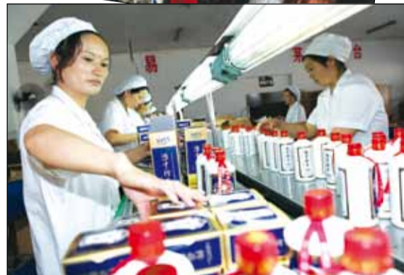
The production line of Jiuzhongjiu liquor, the famous brand located in the city of Renhuai, Guizhou province.