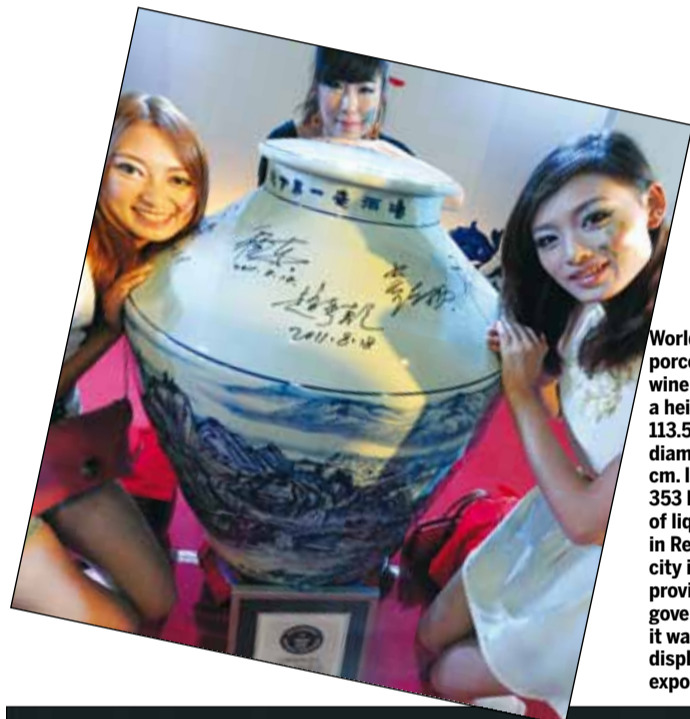
World's largest porcelain wine jar, with a height of 113.5 cm and a diameter of 85 cm. It can hold 353 kilograms of liquid. Made in Renhuai, the city in Guizhou province that governs Moutai, it was on display at the expo.

Contact the writers at yangjun@chinadaily.com.cn, zhaokai@chinadaily.com.cn and sujiangyuan@chinadaily.com.cn