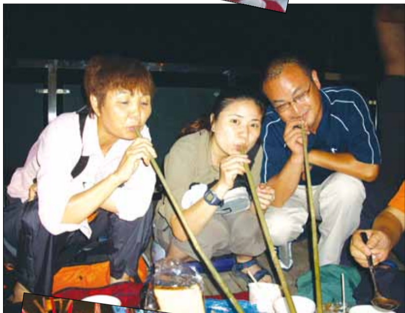
Zajiu, a folk tradition popular among Miao, Yi, Qilao ethnic groups in Guizhou.