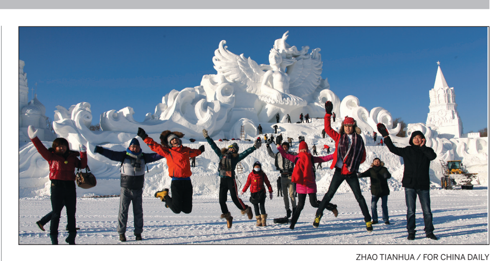
The massive ice sculpture named, "Snow Dance Style", a 26-meter-high, 24-meter-wide statue of a girl dancing with snow attracts many tourists.