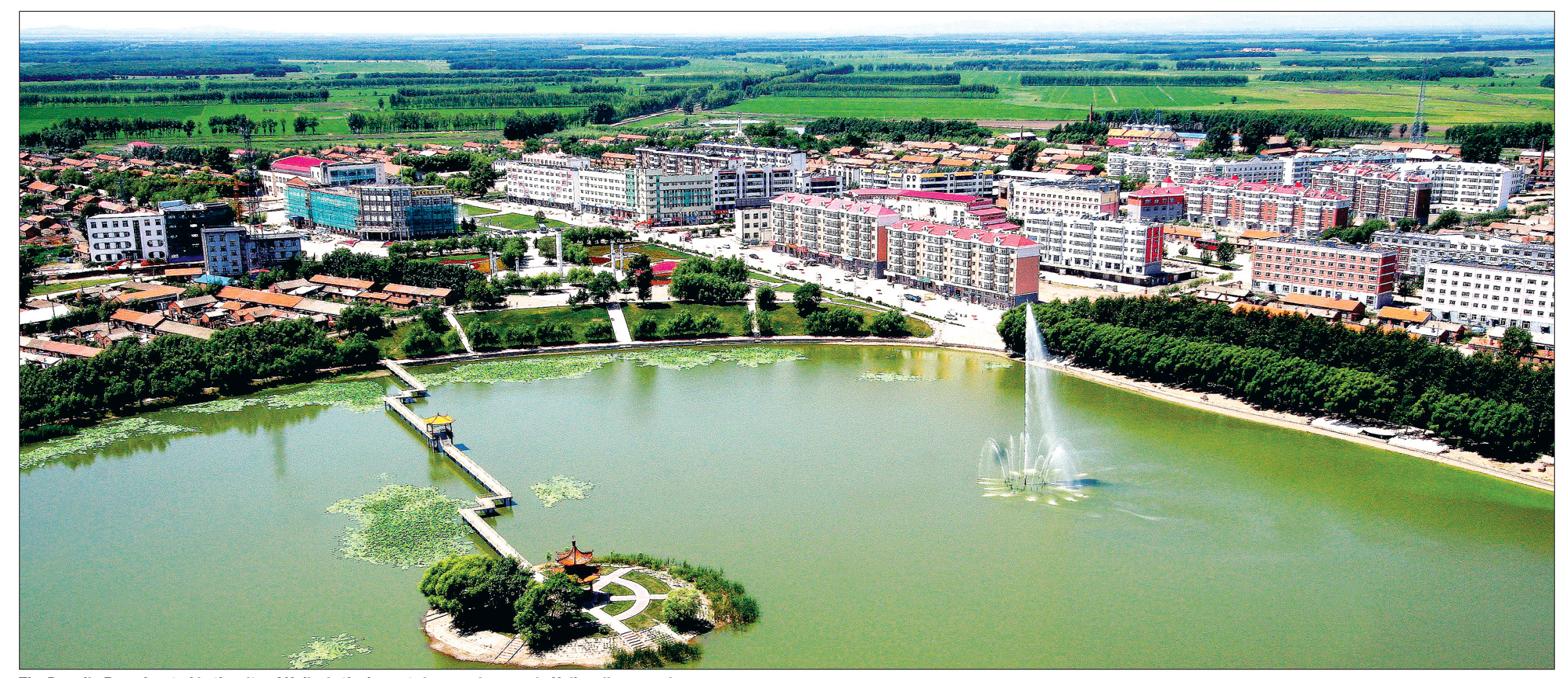
The Bawuliu Farm, located in the city of Hulin, is the largest rice growing area in Heilongjiang province.