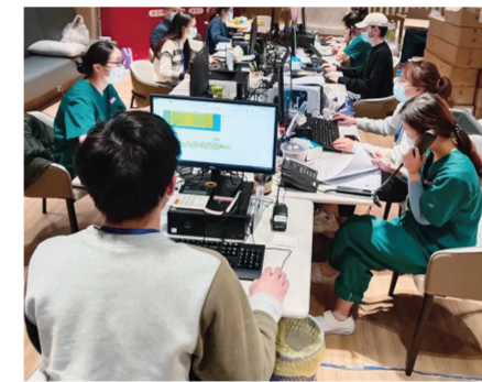
A team of six newcomers of a company has worked as volunteers in quarantine hotel for more than a month. They need to hand out food, print scanning code and take phone calls to gather information.