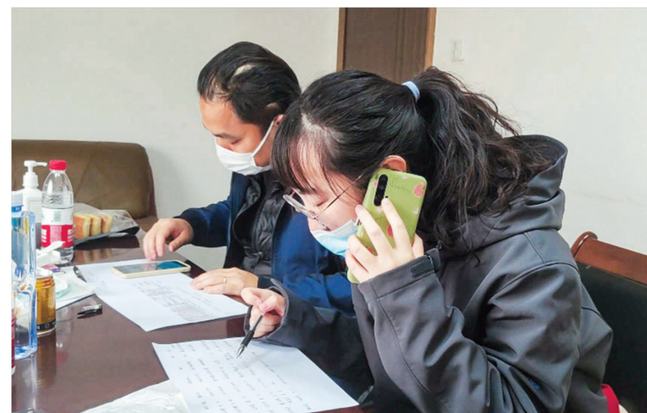
Right: Volunteers check the time and address of those who need a service to go to hospital.

them. To Pu's surprise, however, the six young people requested to extend their service periods, saying "Now we are short of manpower. Let's stick to it for another period of time."