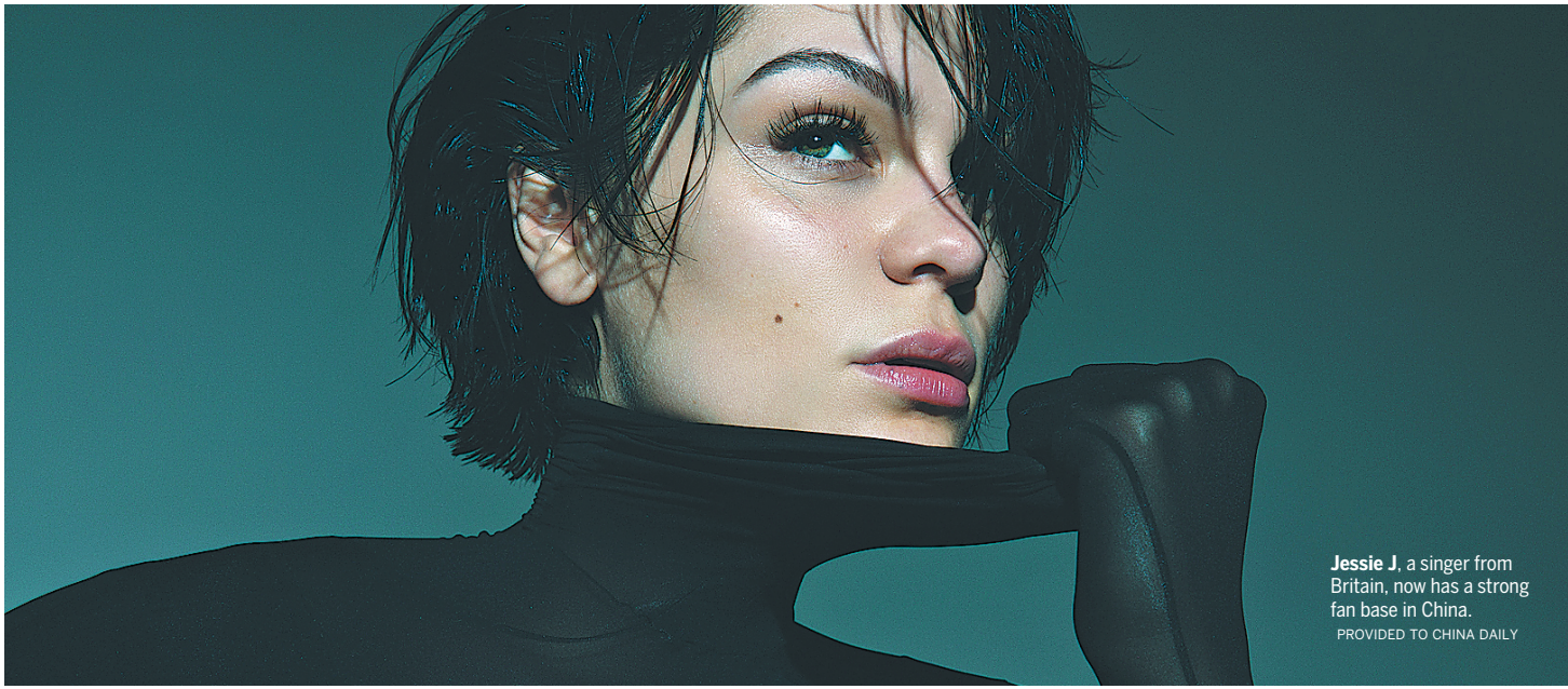
Jessie J, a singer from Britain, now has a strong fan base in China.