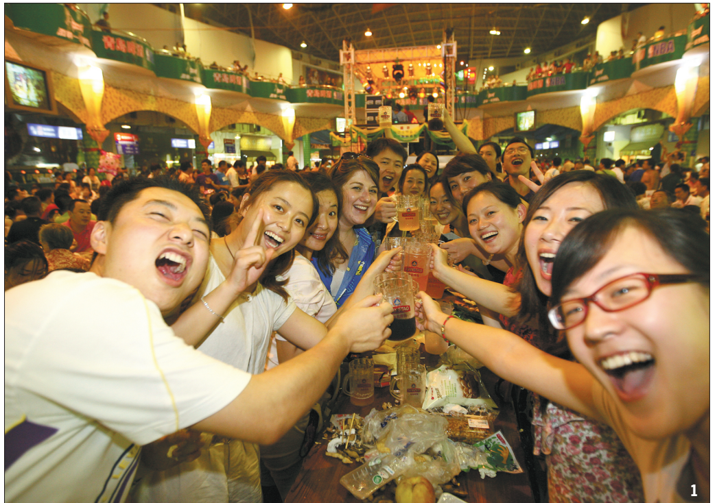
1. Visitors from China and abroad enjoy the evening gala and local culture at the Beer City in Qingdao, Shandong province. 2. The national acclaimed event starts with a gigantic barrel of fresh beer at its opening ceremony.

Shinan district, as the traditional center of the city, will join the August festival spree by hosting Qingdao's first micro film competition, its first daily apparel innovation contest, a beach volleyball tournament, and a bay-themed photography competition.