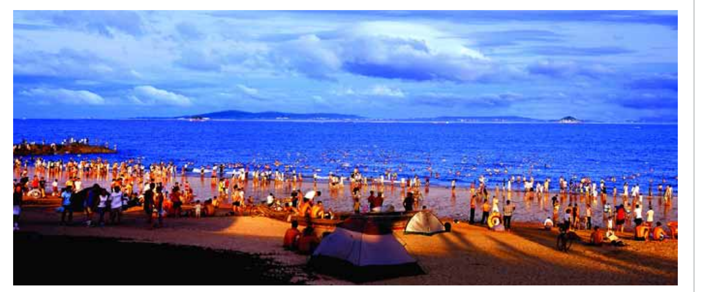
Beaches are a major tourist attraction in Xiamen.

According to Huang, Xiamen has plans for cruise travel, yachting and caravan camping to serve the highend tourism market, adding the island will also be "a shopping paradise".