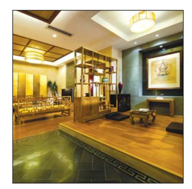
A guest room at the Mahayana OCT Boutique

Rising early is a must. As the meditation corner faces