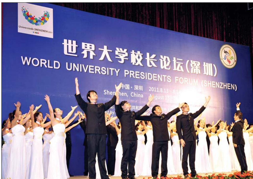
Performers turn on a special performance for the members of the World University Presidents Forum (Shenzhen) at the Sheraton Shenzhen Futian Hotel on Saturday.

The Brazilian was excited when talking about the experience of igniting the games' flame with Liu Xiang. "It was very funny because Liu is tall and has long legs — one of his steps is two of my steps, therefore I