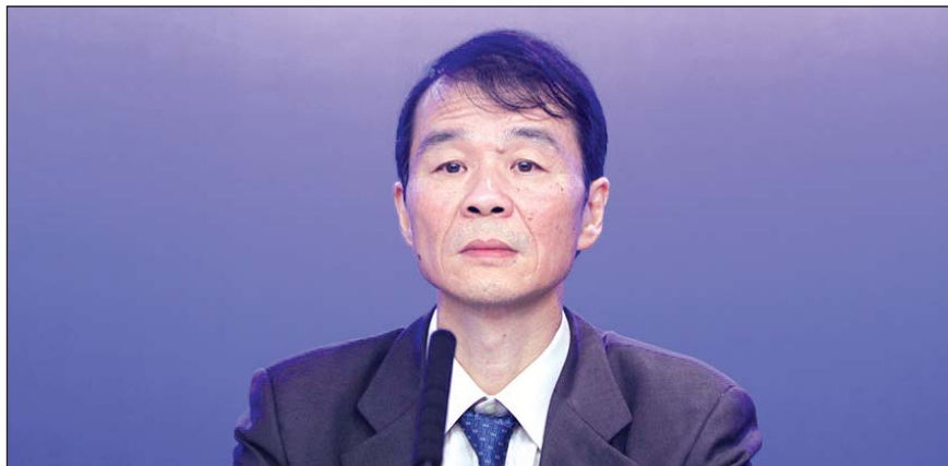
PROVIDED TO CHINA DAILY

For example, the well-known animated television series, "Pleasant Goat and the Big Big Wolf" which was created by local animation company Creative Power Entertainment, has won the hearts of children and adults across the country. The characters of "Pleasant Goat and the Big Big Wolf" have surpassed long-time foreign