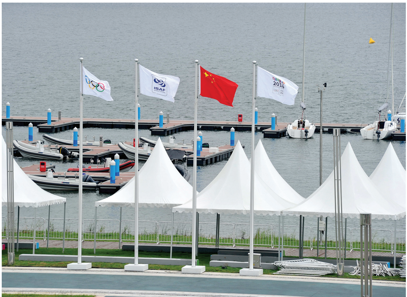
Jinniu Lake sailing venue.