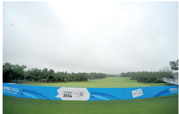
Jiangsu Sports Gymnasium for judo and wrestling; The Xinzhuang equestrian venue; The Zhongshan International Golf Club.