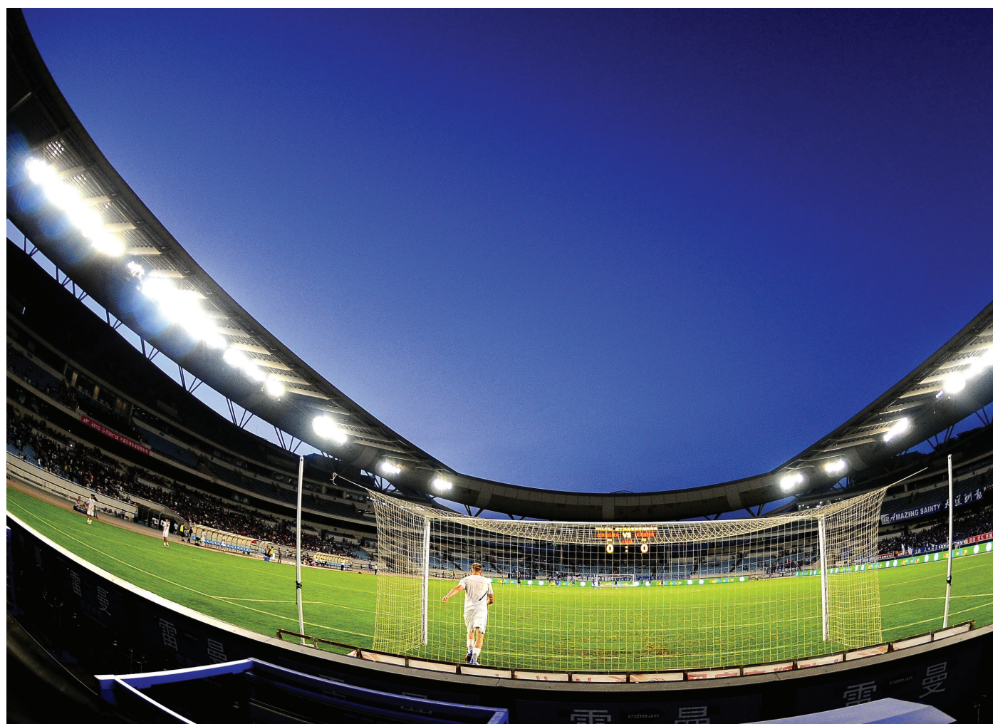
An inside view of the Nanjing Olympic Sports Center.

F rom the main stadium, to the pools, pitches, indoor courts and outdoor water sports venues, the city of Nanjing is about to present to the world a high-class sporting festival which will be both cost-effective and ecologically sound. What the cream of the world's best young athletes will experience during the Second Summer Youth Olympic Games will be passed onto the city's residents as the venues will be made available to the public to further promote sports and healthy lifestyles.