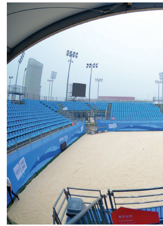
From left to right: Jinniu Lake sailing venue; Nanjing Olympic Sports Center; Beach volleyball arena in the Youth Olympic Sports Park.

F rom the main stadium, to the pools, pitches, indoor courts and outdoor water sports venues, the city of Nanjing is about to present to the world a high-class sporting festival which will be both cost-effective and ecologically sound. What the cream of the world's best young athletes will experience during the Second Summer Youth Olympic Games will be passed onto the city's residents as the venues will be made available to the public to further promote sports and healthy lifestyles.