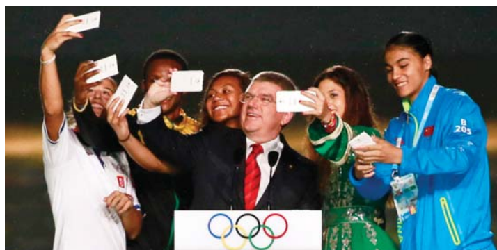
IOC president Thomas Bach takes a selfie with participants at the opening ceremony on Saturday.